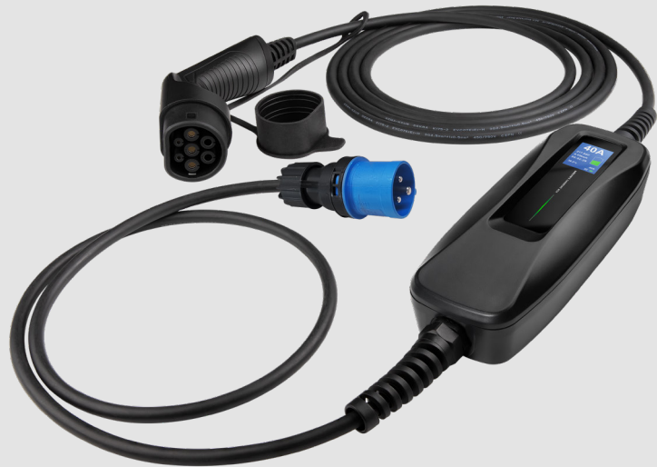
BS-PCD040 High power with LCD screen (6A-40A)